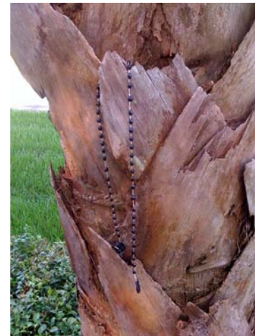
The Rosary Tree